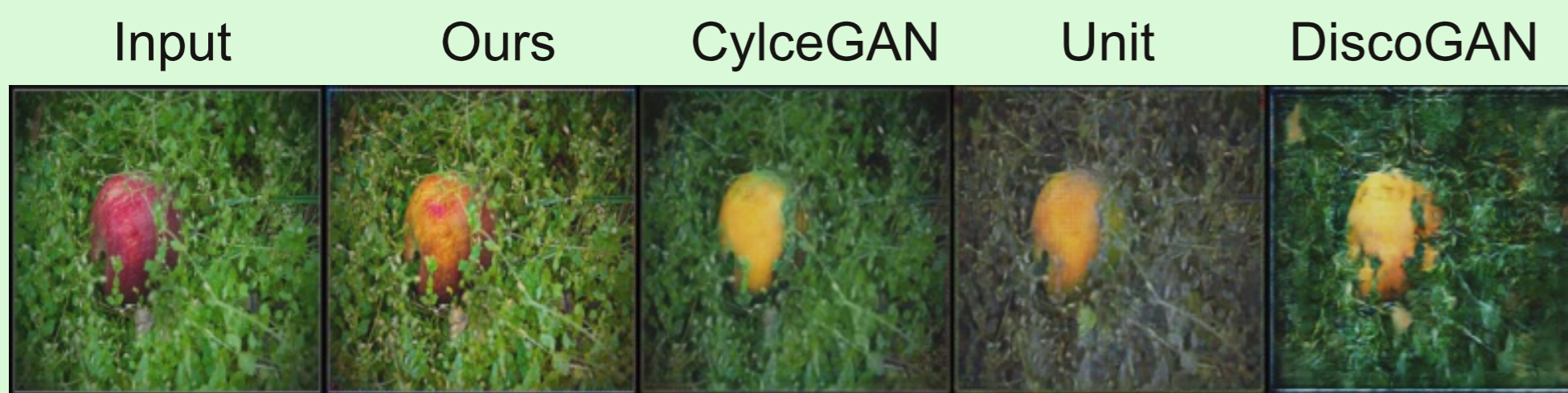
Fig.2. Results comparison

To solve this problem, we design a new module called ED-Block to extract and project edges and boundaries information in advance and add them back to output to improve image quality.