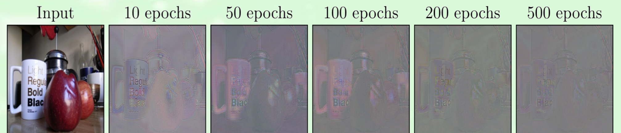
Fig.4. Results of ED-Block

The epoch of training ED-Block should be proper to reconstruct the input image. After many attempts, we set it to 200 epochs.